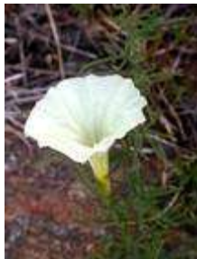
Calystegia stebbinsii