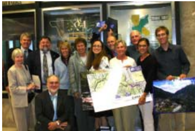
Members of Cache Creek Wild celebrate AB1328 with Assemblywoman Lois Wolk

The mission of the California Native Plant Society is to increase understanding and appreciation of California's native plants and to conserve them and their natural habitats through science, education, advocacy, horticulture and land stewardship.