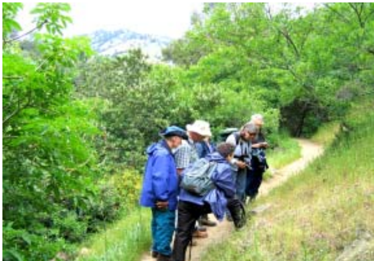
2005 Stebbins Cold Canyon Field Trip

30: Mather Field Vernal Pool Flower Walk See the flyer