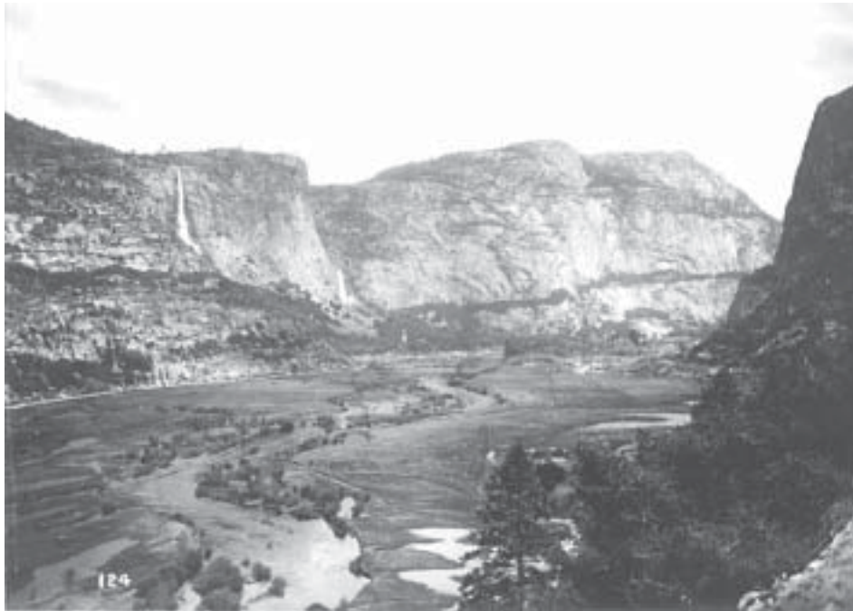
Hetch Hetchy Valley before the dam