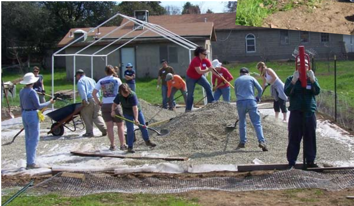
The photos don't do justice to the work or accomplishment!