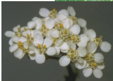
Charles Webber © California Academy of Sciences

run-down condition or a disordered digestion. This brew also makes a rather nourishing broth!"